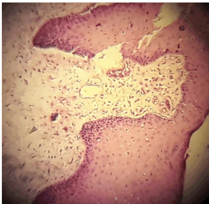
Figure 3: Histological aspect.