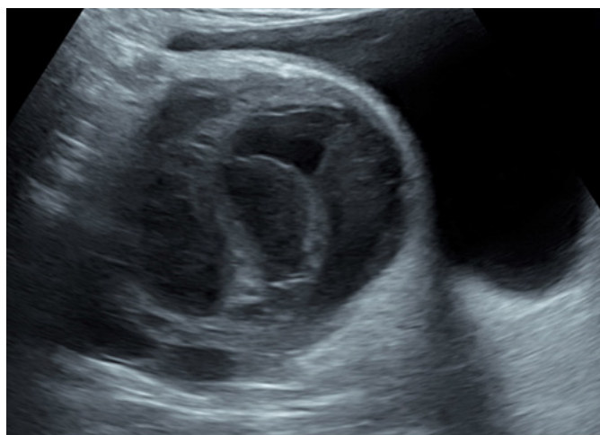
Figure 1: Preoperative abdominal US suspicious for an ovarian mass and potential right ovarian torsion.

The abdomen was copiously irrigated and purulent fluid was sent for microbiological evaluation. An intraperitoneal 15 French Blake drain was then placed in the right lower quadrant. Postoperatively, she was admitted to the intensive care unit (ICU) for management of her elevated blood glucose with an insulin drip. She