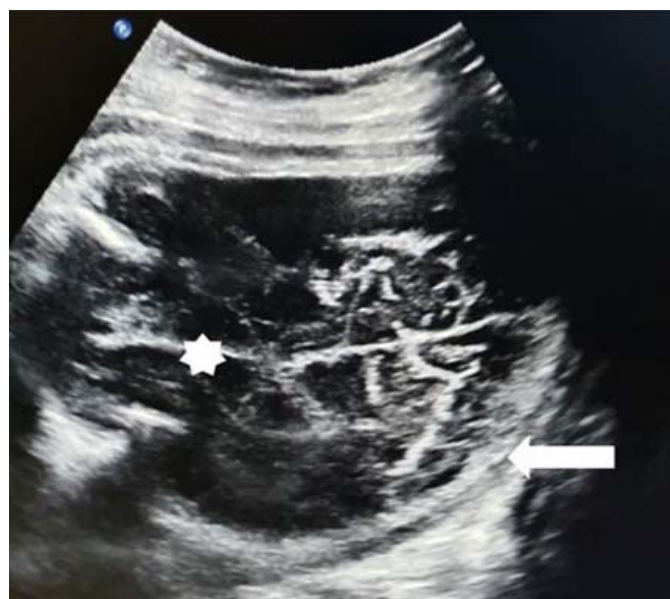
Figure 2: Fetal acrania, gray-scale ultrasound scan of the fetal brain (35 Hz probe) in axial plane, gestational age 34 weeks, no skull around the brain (arrow), asterisk head indicates inter-hemispheric fissure.

normal. Systemic examination was unremarkable. Facial structure and external appearance of rest of the body structures were appeared completely normal. The baby had well-coordinated body movements. On admission, the baby had blue peripheries on room air. Baby's respiration was irregular but, there was no significant cardiac murmur to suggest cardiovascular involvement. The baby was admitted to the neonatal intensive care unit following delivery with a plan of conservative management. The baby developed sudden cardiorespiratory arrest a few hours later and expired. A pathological postmortem was not done as parents did not consent.