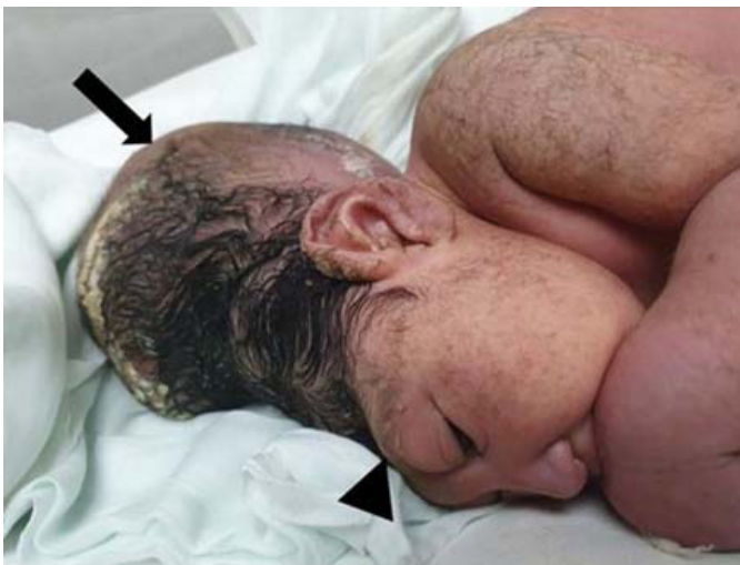
Figure 5: Acrania, demonstrating the absence of cranium with well-developed brain protruding outside the skull base. Arrow indicates fetal brain and arrow head indicates fetal face.