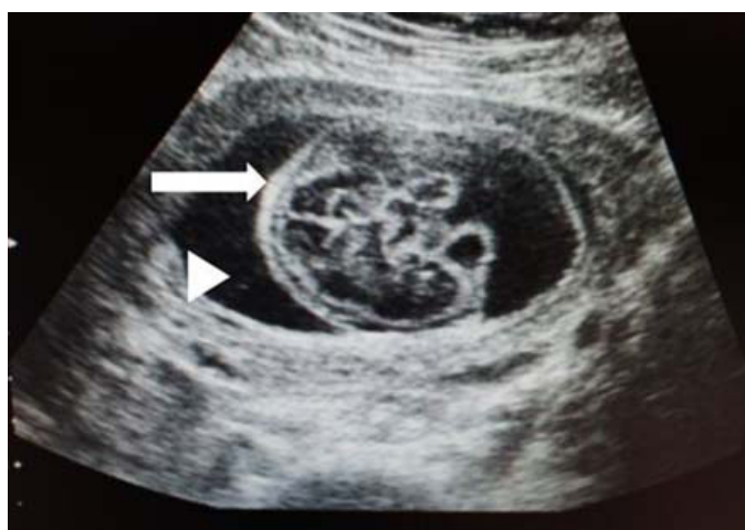
Figure 1: Fetal acrania, gray-scale ultrasound scan of the fetal brain (35 Hz probe) in axial plane, gestational age 14 weeks. No skull around the brain (arrow), arrow head indicates amniotic fluid around the brain.